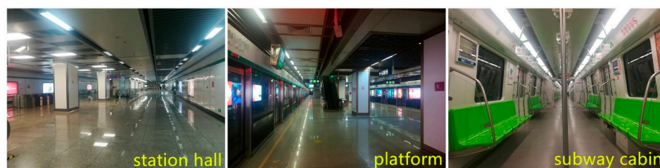
Figure 2. Sampling Sites of Nanjing Metro Line X (NMLX).

The field samplings in three categories of sub-MEs (i.e., thermal environment, air quality, and lighting environment) were conducted in station halls, platforms and subway cabins (Figure 2). This research follows the current standard of subway acoustic environment, viz. the Acoustical Requirement and Measurement on Station Platform of Urban Rail Transit (GB14227-2006) and concentrates on platform situation when monitoring acoustic environment. Besides, the noises on platforms are found in the pilot study that they are commonly composed of e.g., subway trains arriving or leaving, out screen broadcasting, talking noises, and even shoes clattering of passengers.