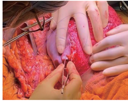
Figure 5 Intraoperative picture of the implant with the biomesh.