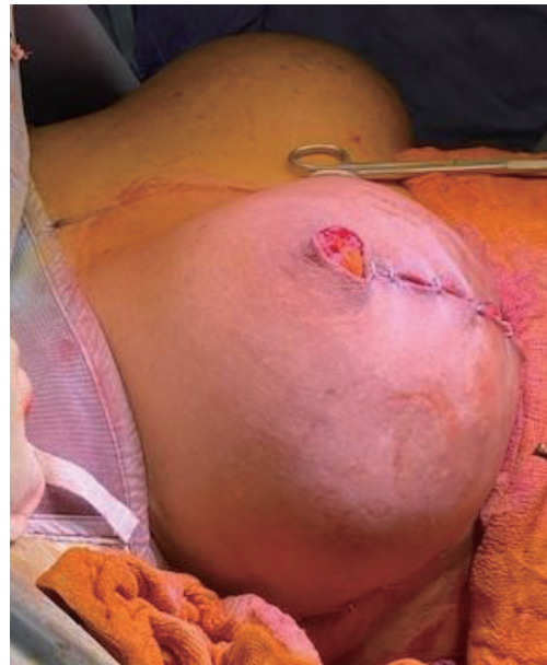
Figure 6 Skin closed with wound clips with implant in place. The size is very similar on the right as the left.

no adverse or unanticipated events. The specimen weight of the mastectomy was 1.911 kg and she had a 650 cc gel breast implant. The right mastectomy specimen comprised fibrofatty tissue measuring 27 cm × 22.6 cm × 7.4 cm and the histology revealed that most of the tumour was benign PASH with some fat necrosis but no atypia seen. To our knowledge this is the largest reported PASH tumour in the English literature. The patient made a good recovery post-surgery and was discharged the following day from hospital. At her follow up clinic appointment 4 weeks after the operation, her wounds had healed well and there had