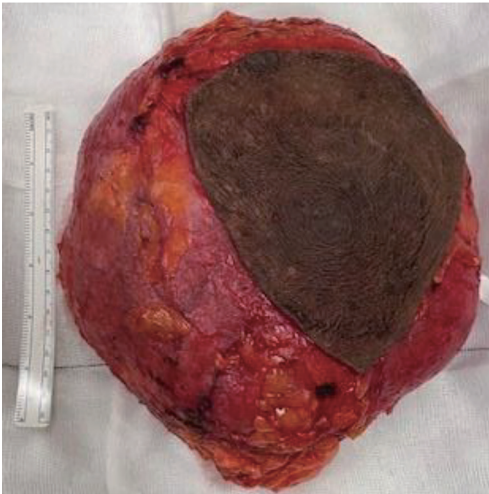
Figure 4 Picture of the excised PASH tumour with a 15-cm ruler as a reference. PASH, pseudoangiomatous stromal hyperplasia.