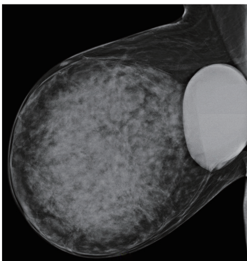
Figure 2 Right breast mammogram, mediolateral oblique view, showing implant and large PASH lesion. PASH, pseudoangiomatous stromal hyperplasia.

explained over the preceding 6 months her right breast had dramatically increased in size and was painful and heavy. In addition, there was a noticeable difference in size between her breasts when wearing clothing. The patient particularly mentioned it made it difficult for her to wear suitable clothing for the gym for which she used to be a regular attendee. Patient was seen by a consultant breast surgeon and underwent triple assessment (history and examination, imaging and biopsy). All procedures performed in this study were in accordance with the ethical standards of the institutional and/or national research committee(s) and with the Helsinki Declaration (as revised in 2013). Written informed consent was obtained from the patient for publication of this case report and accompanying images. A copy of the written consent is available for review by the editorial office of this journal.