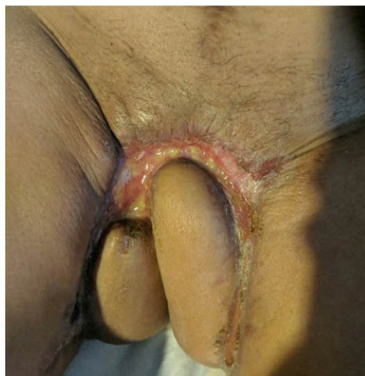
Fig. 2. Anatomical distortion following flap healing and cicatrix formation.

The antegrade cystoscopic approach has mostly been described in limited case series of male patients with urethral strictures. Goel et al.