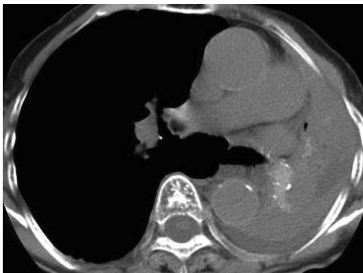
Fig. 2. Chest computed tomography obtained upon admission shows complete collapse of the left lung with hyperattenuated mucoid impaction.

later, chest radiographic findings revealed improvement of the collapsed left lung (Fig. 4A). Two months later, while she was completely recuperating from wet cough and breathing difficulty, SpO 2 increased to 97% at room air and chest CT showed complete recovery of the collapsed lung, but with central bronchiectasis seen (Fig. 4B). Subsequently, she has returned to the clinic for follow-up and has continued bromhexine treatment successfully for more than 20 months. There were no adverse effects of bromhexine.