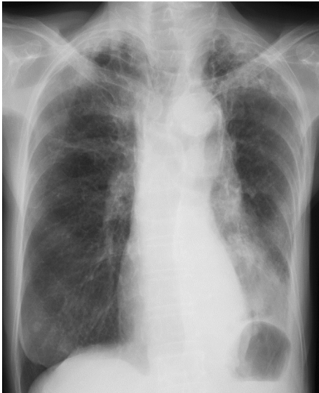
Fig. 1. Chest radiograph on the first visit shows left lower lobe collapse.