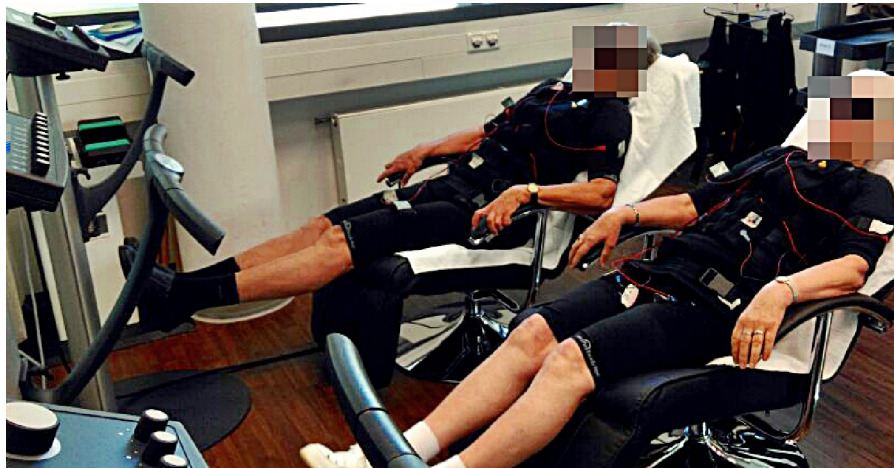
Figure 2 WB-EMS application with slight movements in a supine sitting/lying position. Abbreviation: WB-EMS, whole-body electromyostimulation.