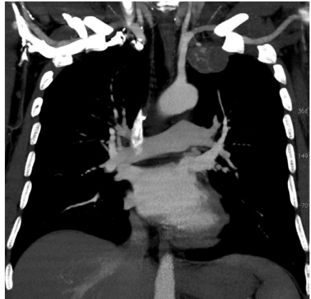
Figure 3: MRI scan of the thorax shows a tumour at the left pleural cupula.

Histological examination of the removed tumour revealed a thrombotic obliterated aneurysm of the IMA. After operation, the patient recovered well. The peripheral pulses were palpable postoperatively and neurological tests did not show any abnormalities. X-ray during follow-up showed normal findings. An arterial duplex scan of the left subclavian arteries showed a good vascular flow (Fig. 3). Six months after operation, the