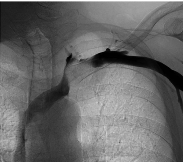
Figure 2: Phlebography reveals a compression of the left subclavian vein.

between the pectoralis major and latissimus dorsi muscle, followed by careful preparation of the first rib, layer by layer. Resection of the first rib was done among sternocostal and costovertebral joint after accurate separation from the underlying pleura. Medial of the pleural cupula a boorish tumour was palpable and the left IMA was walled by this tumour. Therefore, the tumour and the left mammary artery were removed after cautious preparation. After careful arrest of bleeding, the wound was stepwise closed with single button sutures.