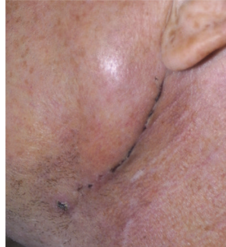
FIGURE 4: Postoperative wound in 14th day after mandibular fracture fixation—L-PRP group.

The average hospitalization time was 3.8 days.