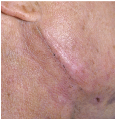
FIGURE 3: Postoperative wound in the 14th day after mandibular fracture fixation—control group.

The average whole blood platelet counts were 223 \pm 69 \times 10^9/L and 1718 \pm 482 \times 10^9/L in L-PRP. The mean leukocyte number was 5,021 \pm 2,001 \times 10^9/L in blood and 39,1 \pm 14,1 \times 10^9/L in L-PRP.