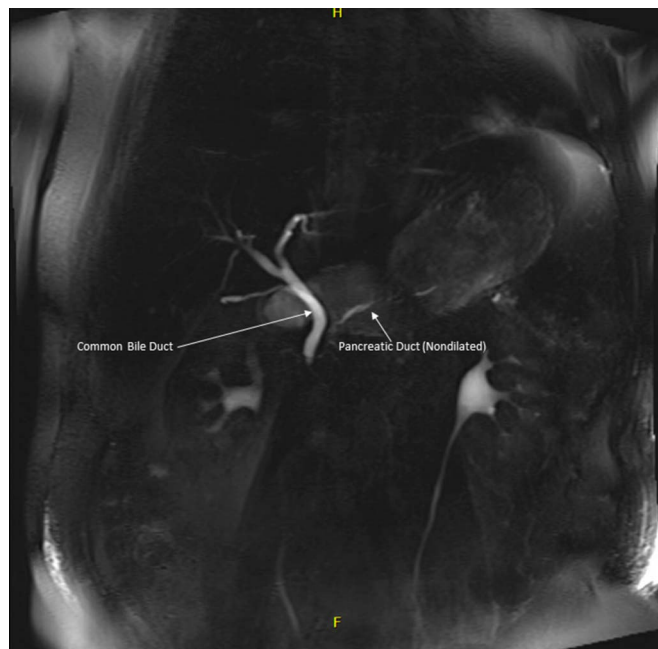
Figure 2. Magnetic resonance cholangiopancreatography revealing nondilated pancreatic duct without stone.

CP is characterized by chronic inflammation that can lead to impairment of endocrine and exocrine function and significant pain. Medical and endoscopic treatments are associated with severe CP pain control in 50%–80% of patients and rarely do patients end up undergoing surgical procedures to manage CP pain. 4 Chronic pain in this condition is believed to arise from elevated pressures in obstructed PD, and the modified PJP is one of the most common procedures to achieve decompression of the PD. It involves creating a longitudinal opening of the PD, which is anastomosed to a Roux-en-Y limb of the small intestine opened longitudinally (Figure 4).