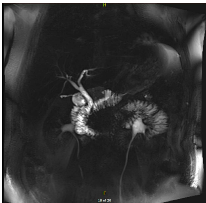
Figure 3. Secretin stimulation test with normal secretin stimulation.

The procedure has been reported to have a good success rate with pain relief in 66%–91% of patients with a mean follow-up of 3.5–9.1 years. 5 However, this procedure is preferred in patients with diseases located to the left of gastroduodenal artery and is less favored for disease involving the pancreatic head. 1 The main reason RAP after PJP is the poor drainage of the Wirsung and/or Santorini ducts in the pancreatic head. We could not find a report of RAP involving the tail of the pancreas after PJP as seen in our patient. Of note, abstinence from alcohol after procedure is