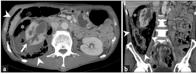
Figure 2: Axial (a) and coronal (b) abdominal computed tomography. Gas collections are noted in the retroperitoneal perirenal space (*) and posterior pararenal space (arrowheads). Right hydronephrosis with ruptured right renal parenchyma and pelvicalyx is also shown (arrow)

numerous small air bubbles, from gas-forming organisms in the retroperitoneal adipose tissue and create the specific manifestation of a “mottled air sign” on KUB [6].