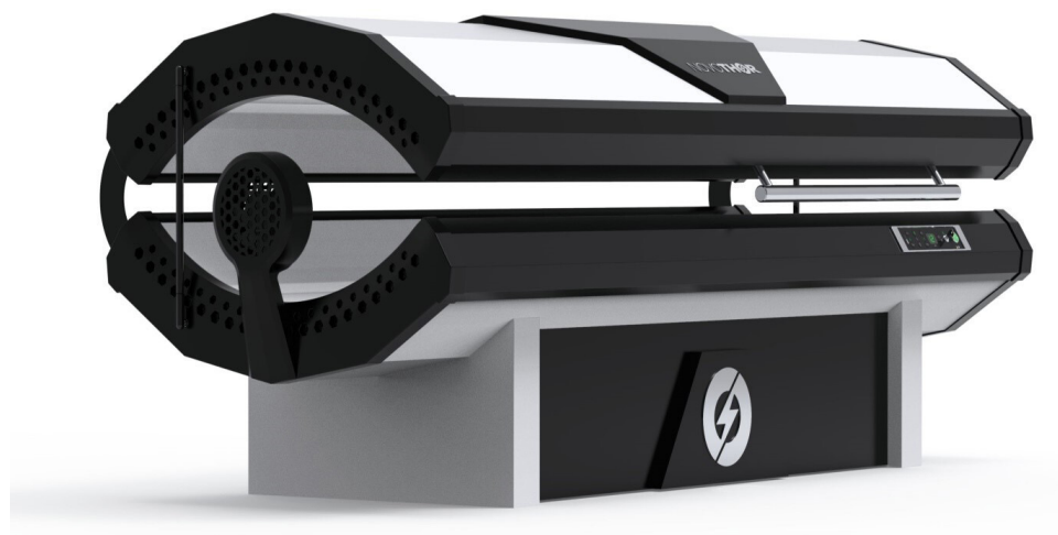
Figure 1 NovoTHOR. Reprinted with permission.