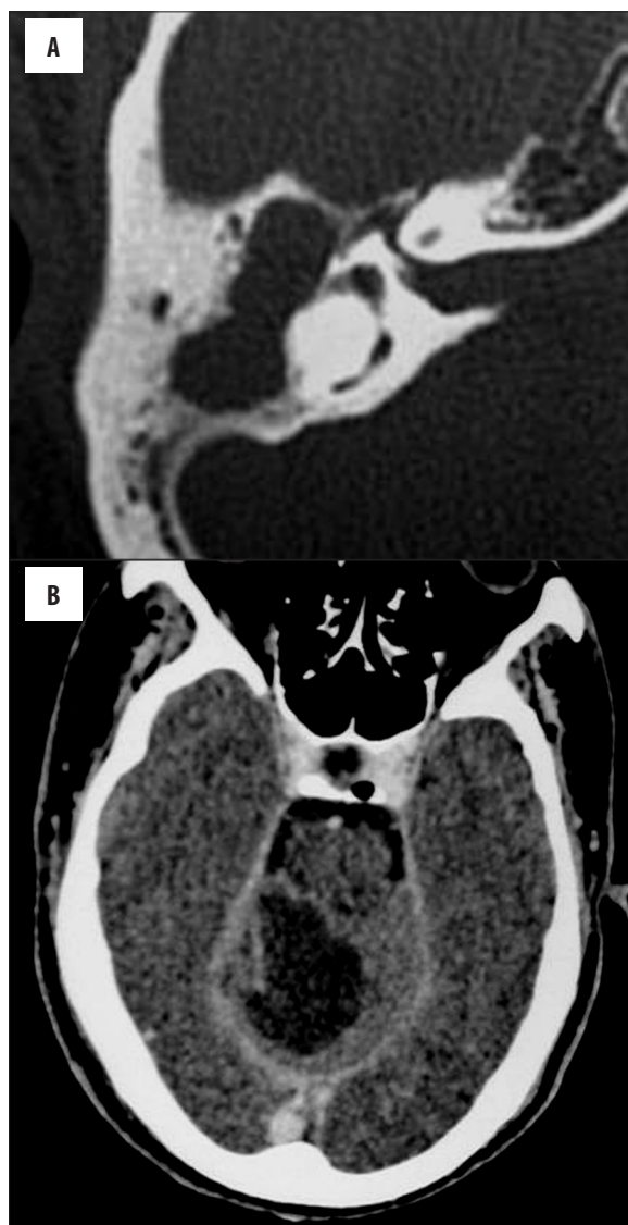
Figure 3. Acquired cholesteatoma of the middle ear with intracranial abscess (C2): (A) Axial CT scan of the petrous bone shows cholesteatoma of the right middle ear and right mastoid. (B) Axial contrast CT scan of the same patient shows marginally enhanced right cerebellar abscess.

tissue mass opacity located in Prussak's space lateral to the ossicles, while tympanic cholesteatoma occupies the tympanic space medial to the ossicles, usually with typical involvement of the facial recess and sinus tympani. In atticotympanic cholesteatoma, cholesteatoma fills most of the tympanic cavity [31,32]. Attic cholesteatoma was seen in 41% of patients, tympanic cholesteatoma in 45%, and combined attic and tympanic cholesteatoma in 14% [4].