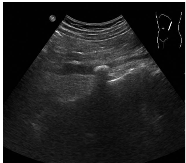
Figure 1. Gray-scale imaging to measure the calculus size and to confirm the calculus location and AS level. AS = acoustic shadowing.

All examinations were performed by a single ultrasonologist (with 7 years of experience) using a Philips iU22 ultrasound scanner (Philips Medical Systems, Bothell, WA) using a C5-1 curvilinear array probe. All patients underwent ultrasonography the day before lithotripsy. No special preparation was required for the patients with kidney or proximal/middle ureter calculi. Patients with calculi in the distal ureter were requested to moderately fill their bladders. Scanning started with gray-scale imaging to measure the calculus size and to confirm the calculus location and the presence or absence of AS (Fig. 1). After the largest and clearest image of the calculus was obtained, the