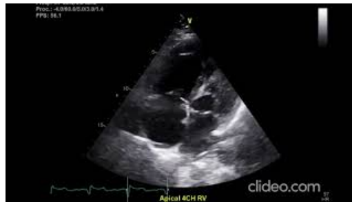
VIDEO 1: Transthoracic echocardiogram showing moderately reduced right ventricular function and enlarged right ventricle.

A 59-year-old female with newly diagnosed invasive ductal carcinoma of the right breast and high-grade ductal carcinoma in situ of the left breast was initiated treatment with doxorubicin and cyclophosphamide. About one week after receiving the first cycle, the patient developed worsening lower extremity edema and shortness of breath. She was then hospitalized, and a transthoracic echocardiogram (TTE) revealed moderately reduced right ventricular function, enlarged right ventricle with severe pulmonary hypertension, and estimated pulmonary artery systolic pressure of 79.5 mmHg, assuming a right atrial pressure of 10 mmHg as seen in Videos 1, 2.