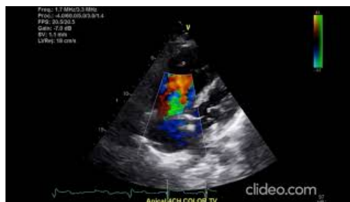
VIDEO 2: Moderately reduced right ventricular function, enlarged right ventricle with severe pulmonary hypertension, estimated pulmonary artery systolic pressure of 79.5 mmHg, assuming a right atrial pressure of 10 mmHg based on echocardiography calculations.

View video here: https://youtu.be/EK8s3bM15KM