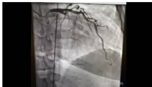
VIDEO 3: Coronary angiogram revealed severe pulmonary hypertension without response to nitric oxide, mild to moderate elevation in left ventricular end-diastolic pressure, pulmonary capillary wedge pressure,

Coronary angiogram revealed severe pulmonary hypertension without response to nitric oxide, mild to moderate elevation in left ventricular end-diastolic pressure, pulmonary capillary wedge pressure, and normal coronary anatomy (Videos 3, 4).