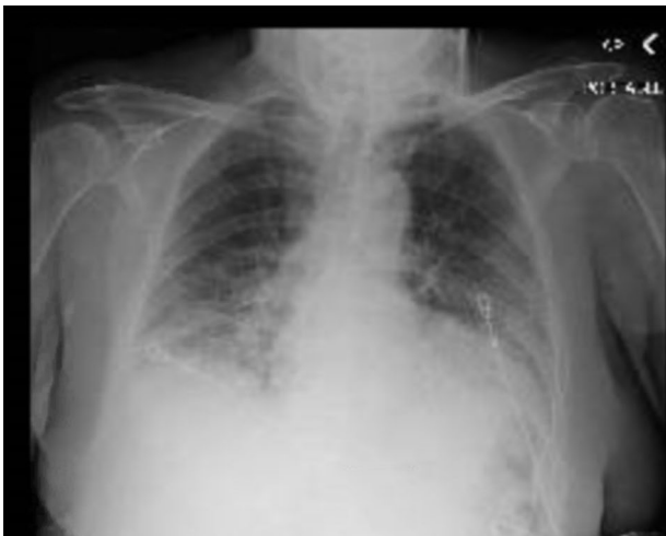
Figure 1. Chest radiograph on admission showing basilar opacities, blunting of the costophrenic angles, and reticular markings.

Abbreviations: BUN, blood urea nitrogen; eGFR, estimated glomerular filtration rate; RBC, red blood cell; WBC, white blood cell.