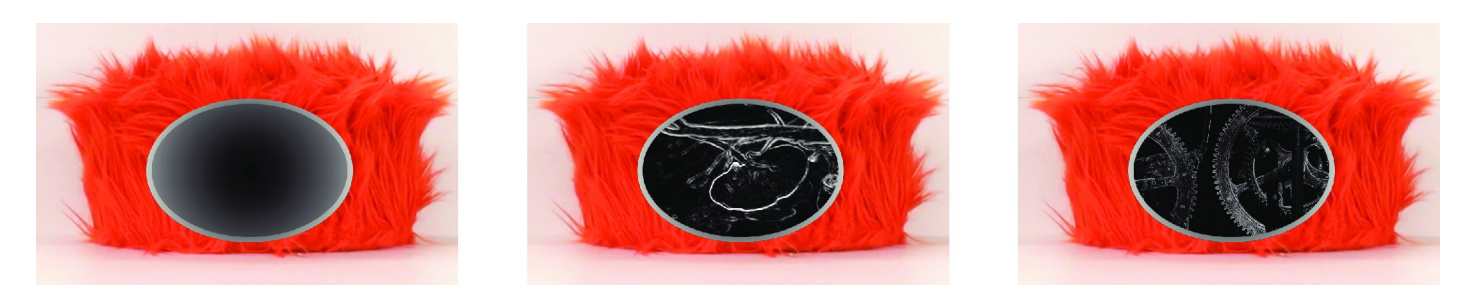
Fig 1. Example of the "X-ray" images that children were asked to choose between. The "Empty" insides are on the left, "Biological" in the middle, and "Mechanical" on the right.

https://doi.org/10.1371/journal.pone.0251081.g001