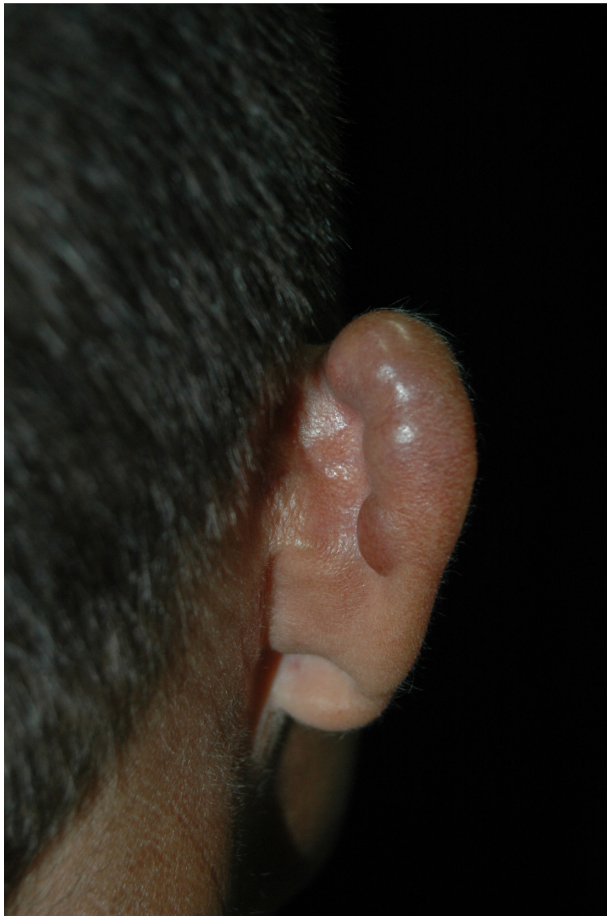
Figure 1 Patient presents with multiple nodules in the right auricle, a typically affected area.

modifications leading to a more polymorphic clinical picture. Dyschromic changes are commonly described, varying from hyperpigmentation to hypopigmentation and achromia. 7,9,23