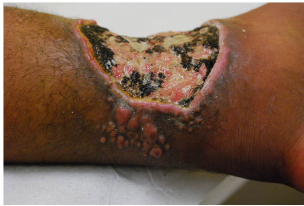
Figure 5 Ulcerated presentation with small fibrous plaques and nodules at its borders.

This classification is aimed to program the therapeutic strategy. 104