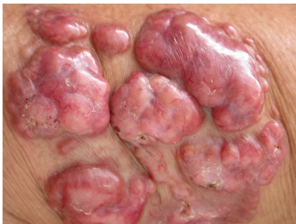
Figure 2 Typical primary fibrous appearance, with nodular plaques covered by smooth and shiny skin, with small exulcerated areas and visible telangiectasias.

Ulcers are believed to be secondary to trauma, especially after maceration that occurs in the rainy season.