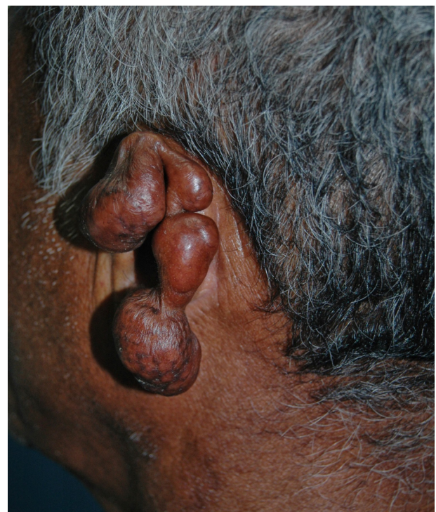
Figure 3 Local destruction of the left auricle, presenting exophytic erythematous-brownish lesion, with a pedunculated aspect and telangiectasias.

Emergence of new wounds around the index lesion raises questions about autoinoculation or local lymphatic dissemination, although continuous exposure cannot be discarded. This picture may lead to confluent lesions forming big plaques or the presence of hundreds of lesions. Autoinoculation has been documented in a case where the donor site for skin graft evolved with a lobomycosis lesion; contaminated material was the probable cause. 106 Local