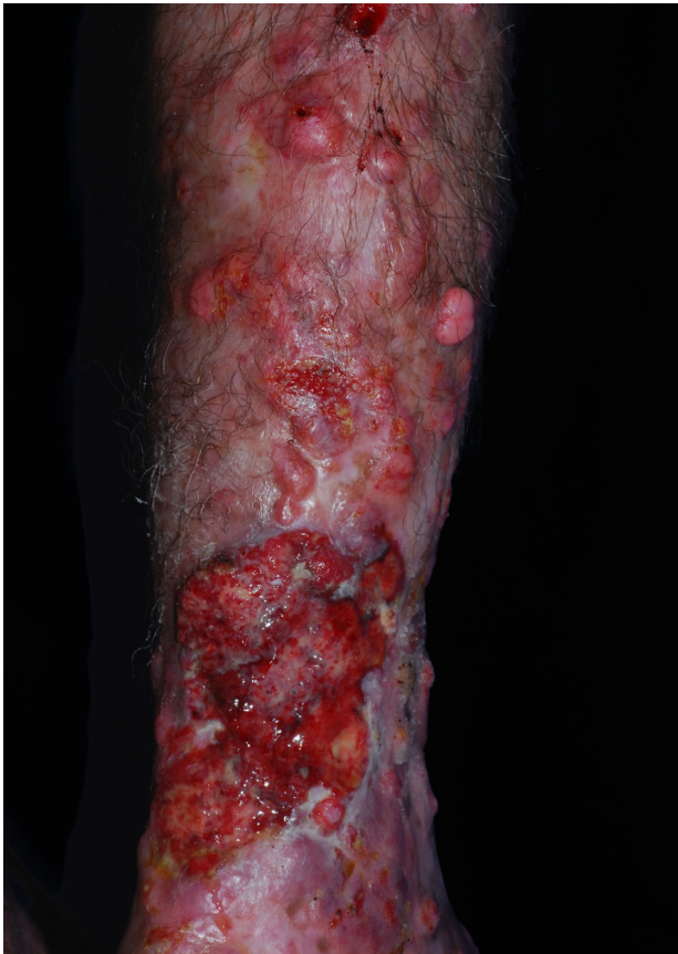
Figure 4 Superimposed carcinomatous degeneration on typical fibrous Lacaziosis nodules.

Classifications have been proposed and are essentially based on clinical aspects of the disease. A morphologic classification subdivided the cases into infiltrative, keloid-like, in plaques, verruciform, and ulcerated forms (Figure 5). 109,110 A classification based on the immunologic response to the fungus was proposed by Machado: hyperergic (macules and gumma) and hypoergic (keloid-like). 111 An operational approach proposed one classification based on the distribution of the disease as follows: localized or isolated disease, multifocal disease (restricted to an anatomical area), or disseminated disease (more than one anatomical segment).