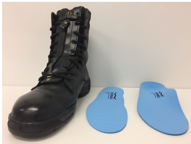
Figure 1. The three experimental conditions. Left to right: (i) Oliver defence boot; (ii) flat insole; (iii) contoured foot orthosis.