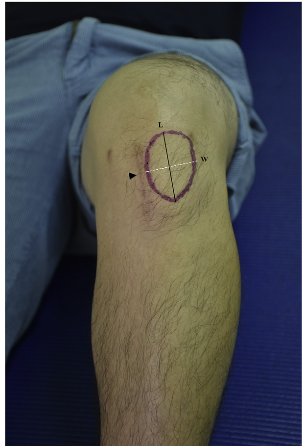
Fig. 4. The area of decreased sensation was delineated by drawing the points of numbness near the surgical scar (marked by the black arrowhead). The longest line (L) was drawn first, followed by a line (W) perpendicular to it. The size of the numbness area was determined with the formula L \text{ (cm)} \times W \text{ (cm)} = \text{area (cm}^2\text{)} .

Descriptive statistics were used to summarize the demographic data. All categorical data were reported as a number or percentage, while the continuous data were reported either as the mean \pm standard deviation and 95% confidence interval (CI), or as the median with a range, as appropriate. The Shapiro–Wilks test and visual inspection revealed if the data were sufficiently normal for the use of parametric statistics. McNemar's test was used on paired nominal data. In the case of continuous data, the paired t -test or the Wilcoxon's signed test was used, as appropriate, to find