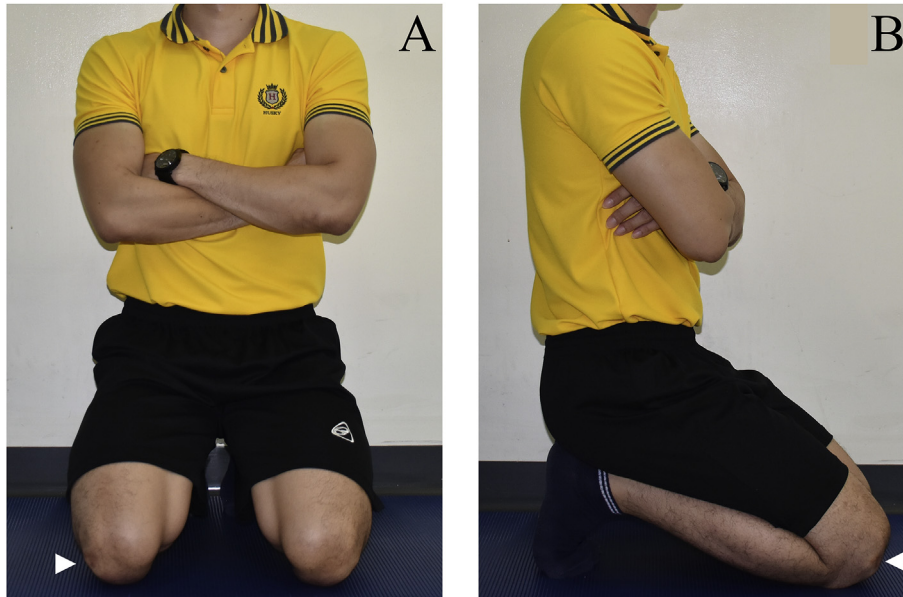
Fig. 3. Kneeling. Frontal (A) and lateral (B) views of a patient sitting on both knees, with the torso in an upright position. The affected knee (denoted by the white arrowhead) is on the patient's right.