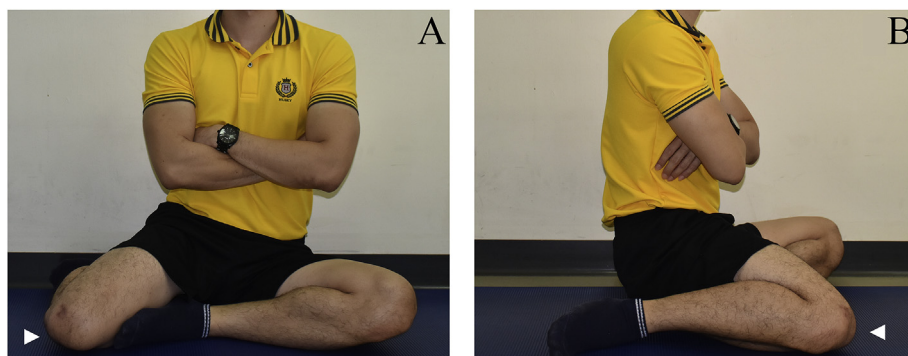
Fig. 2. Sitting one-legged. Frontal (A) and lateral (B) views of a patient sitting on the floor, with the affected knee (marked by the white arrowhead) below the contralateral knee.

As to the anatomical, single-bundle, ACL reconstruction, the femoral tunnel was drilled at the center of the femoral footprint of the ACL using the transportal technique. The tibial tunnel was also drilled at the center of the tibial ACL footprint. The BPTB graft was fixed with a bioabsorbable interference screw, firstly to the femoral tunnel, and then to the tibial tunnel, at a position of full knee extension. The donor site's bone-defects at the patella and the tibial tubercle were filled with the autologous bone graft collected while trimming the bone plugs and drilling the tibial tunnel. A post-operative accelerated rehabilitation program was undertaken, starting with an early range of motion exercises and partial weight bearing, as tolerated, with the use of crutches. 9