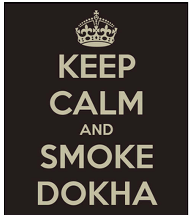
Figure 2 Marketing image found on posters, t-shirts, mugs and key chains.