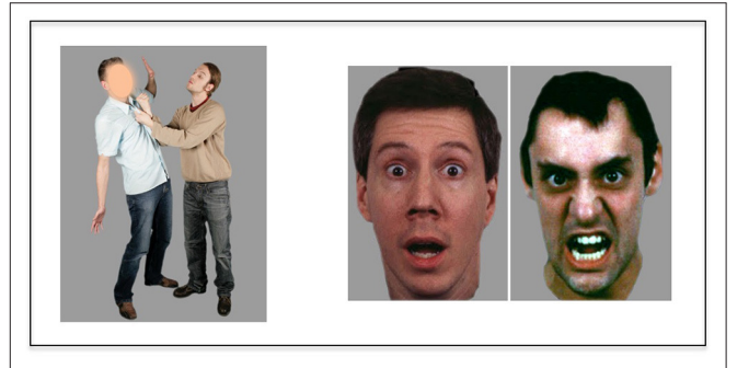
FIGURE 1 | Schema of emotion perspective-taking task. Participants are asked to choose which emotional expression (shown on the right) fits with the masked face (shown on the left).

MR scanning was performed at both baseline and follow-up visits ( \sim 24 months post-baseline) on a 3T TIM Trio system (Siemens Medical Systems) at Northwestern University's Center