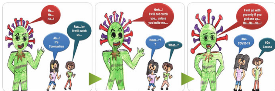
Fig. 15.3 A child's imagination and reflection about the novel coronavirus 2019. It shows that children are keen to know about the virus and are ready to face it. (©Picture courtesy: Aditi Saxena, Sixth Standard)

situation by our positive approach, so that our children should strengthen themselves. We can ask the children especially of lower age group to give their input by depicting their knowledge about the virus by writing stories and poems or by drawing posters, cartoons demonstrating their courage to fight the demon coronavirus as shown in Fig. 15.3. In addition, it is essential that families are not short of their basic needs (e.g., food, shelter, and clothing) otherwise instead of dealing with their children's stress, they will themselves be worrying about their inefficiency to provide proper nutrition and safety to their children.