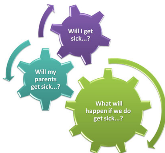
Fig. 15.2 The burning questions in the mind of children. These are the flickering questions in the minds of our kids due to the fear of pandemic

Fears or anxieties are the usual part of the normal development of the child (Gullone 2000). But the myths and the pessimistic information surfacing around the children during the critical situations like COVID-19 pandemic may inoculate those fears in children which become a major health concern (Kessler et al. 2005). The way the parents transfer the information to the children about the pandemic is highly responsible for the fear levels of the children apart from the information received from media, pals, school and other community members, or direct encounter with the infection (Remmerswaal and Muris 2011). The haunting thoughts that may probably capture kids' minds right now are depicted in Fig. 15.2.