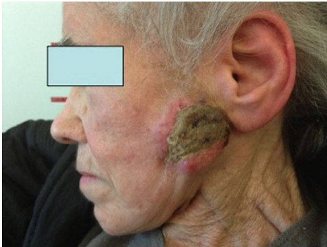
FIGURE 1 Ulcerated skin lesion of the left parotid

dissection (level Ib-II-III) were performed. Reconstruction of the facial region was performed using a radial fasciocutaneous free flap. No primary reconstruction of facial nerve was performed considering the poor prognosis and advanced age of the patient.