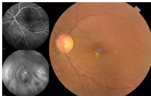
Figure 1 Upper left: fundus fluorescein angiography image in late arteriovenous phase of the posterior pole, including the posterior margin of the tumor before intravitreal injection of dexamethasone. Lower left: infrared image of the tumor. Right: color fundus photography of the posterior pole before intravitreal injection showing retinal exudates, microaneurysms, and narrowing of retinal vessels with focal irregularities.

At the preinjection assessment, no systemic risk factors for the development of ME, such as diabetes mellitus and hypertension, were reported. Slit-lamp examination showed no signs of radiation cataract, radiation papillopathy, retinal neovascularization, or any other pathologies that might have affected visual acuity. BCVA was 6/12 and IOP 12 mmHg. Fundus exploration showed retinal exudates, microaneurysms, and narrowing of retinal vessels with focal irregularities. No signs of retinal ischemia were observed on FFA images, but an area of hypofluorescence in the foveal region was evident (Figure 1). According to OCT-based grading scale proposed by Horgan et al, RME was classified to grade 2