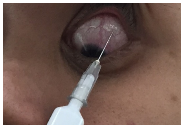
Figure 1 Posterior subtenon injection of triamcinolone acetonide.

Postoperative data, collected on 1 day, 1 week, 2 weeks and 1, 2, 3, 6, 9 and 12 months included IOP, AC cells, BCVA, the morphologic characteristics of the filtering bleb (the Indian Bleb Appearance Grading Scale 9 ) and complications, that could be attributed to the PSTA, trabeculectomy or both, such as blepharoptosis, cataract