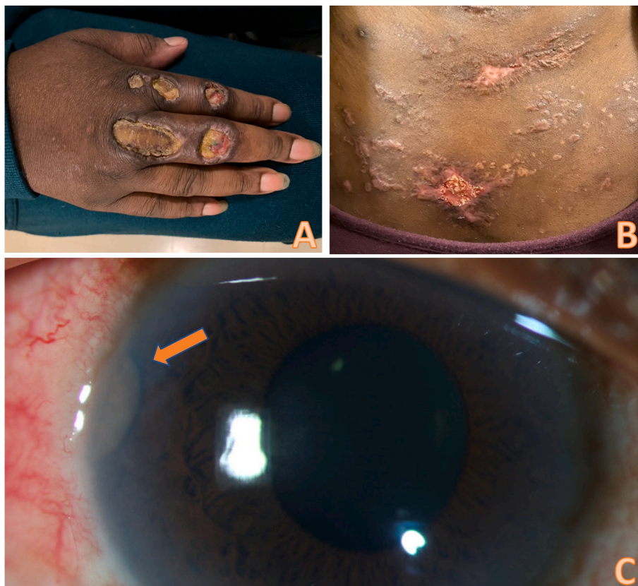
Fig. 1. Active skin lesions of A: right hand and B: upper chest. C: Iris nodule right eye.

Thermal therapy may be an effective alternative for Sporothrix endophthalmitis affecting the anterior segment with lower risk for toxicity than intraocular injection of antimicrobial therapy.