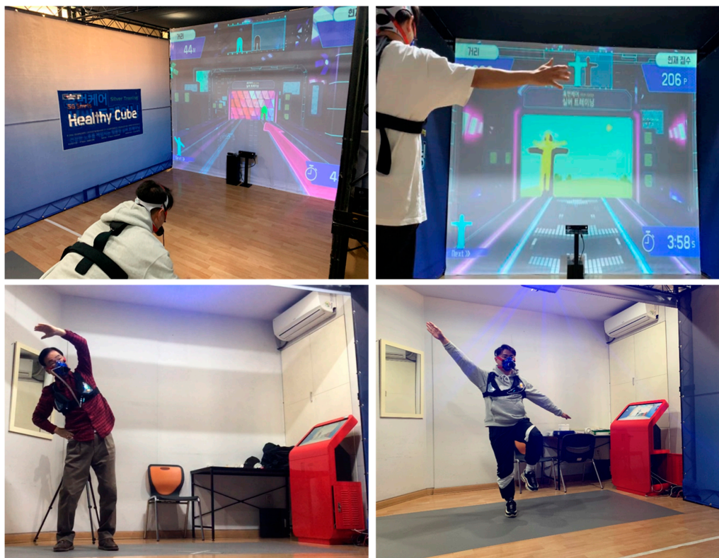
Figure 1. Exergames (Action-Racing).

All participants visited the laboratory twice. During visit 1, participants were familiarized with exergames (Action-Racing, Cloud Gate, Inc., Gangnam, Seoul, Korea), which involved five activities (standing, sitting, stopping, jumping, and arm swinging) for 5 min (Figure 1). During visit 2, participants carried out the protocol of exergames comprising whole-body exercise by maintaining an exercise score of over 70 points (the achieved level of exercise intensity and movement score).