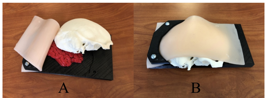
FIGURE 1: Construction stages of an emergent burr hole/craniotomy simulator

The assembly of the 3D-printed EBHC simulators was divided into two categories: SDHs (accumulation of blood between the brain and the dura) [16] and three EDHs (accumulation of blood between the dura and the skull) [17]. Each individual simulator took approximately 40 minutes to construct; from individual printed components to finished product. To construct the EBHC simulator, the brain was inserted into the simulator base (Figure 1a), then depending on epidural or subdural models, the blood clots were placed. For the SDH simulator model, the blood clots were added before the placement of the dura membrane. For the EDH simulator model, the dura membrane was placed on top of the brain, followed by the blood clots. The skull was then placed. The dura membrane and skull were secured to the base using epoxy. Finally, the skin was draped over the skull (Figure 1b) and secured using the clamps on the base and additional hardware.