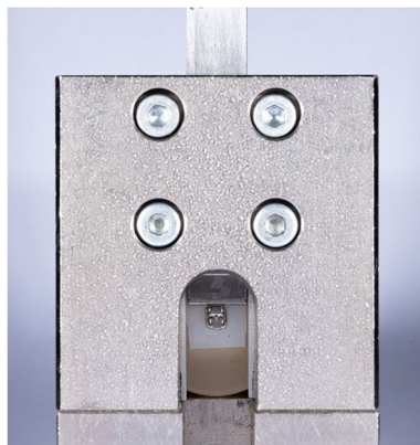
Figure 2. Experimental setup for the SBS measurements. Zirconia substrate with the metal bracket is placed in a special test apparatus. The force was applied in occlusal-lingual direction and the maximum force was recorded.

were directly stored in distilled water and underwent one of the three aging regimens (24 h, 500 thermal cycles, 90 days) as shown in Fig. 1. Detailed information on the materials used is given in Table 1.