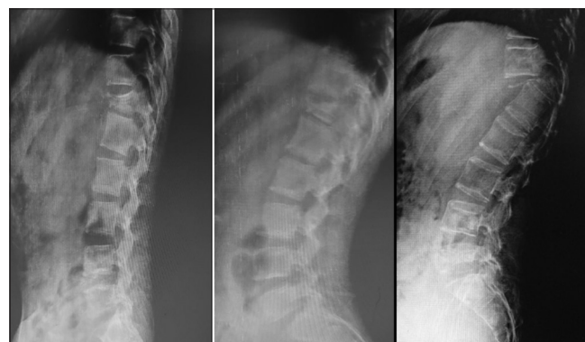
Figure 2: Sequential lateral radiographs of dorsolumbar spine done at 2 months, 4 months, and 6 months (from left to right) after starting multidrug-resistant antituberculous therapy showing gradual collapse of D12 vertebra at 2-month and 4-month radiograph whereas complete collapse at 6-month radiograph