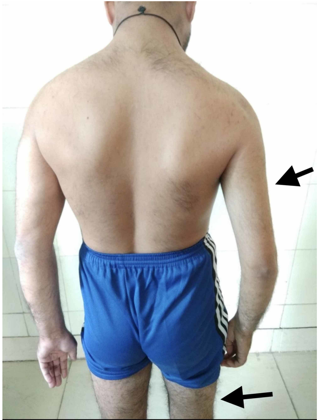
FIGURE 2: Muscular atrophy over right side compared to the left side.

Complete blood count, basic metabolic panel, liver function and kidney function were under normal limits. Coagulation studies including prothrombin time, bleeding time and partial thromboplastin time were normal. Serum phenytoin level was above therapeutic levels. On MRI, a general atrophy of the entire left cerebral hemisphere with dilation of ventricles was noticed (Figure 3).