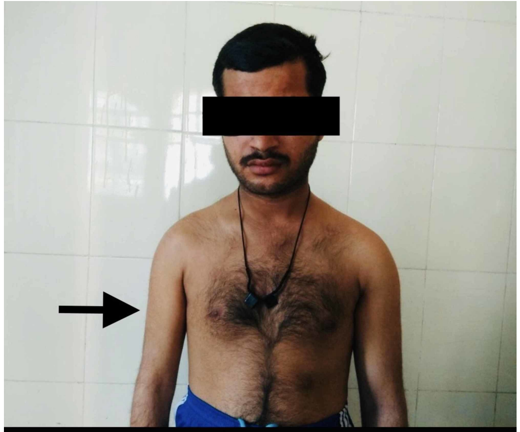
FIGURE 1: Right-sided muscular atrophy.

patient was referred to Sarawathi Institute of Medical Sciences. The patient also complained of difficulty balancing, changes over gums and nausea which started few days ago. The patient recently changed the dose of phenytoin which was prescribed by general practitioner. Examination revealed gingival hyperplasia, normal cardiovascular and respiratory examination. On central nervous system examination there was right-sided hemiparesis along with hypertonia, hyperreflexia and extensor plantar reflex. Right-sided muscular atrophy was clearly observed as shown in Figure 1 and Figure 2.