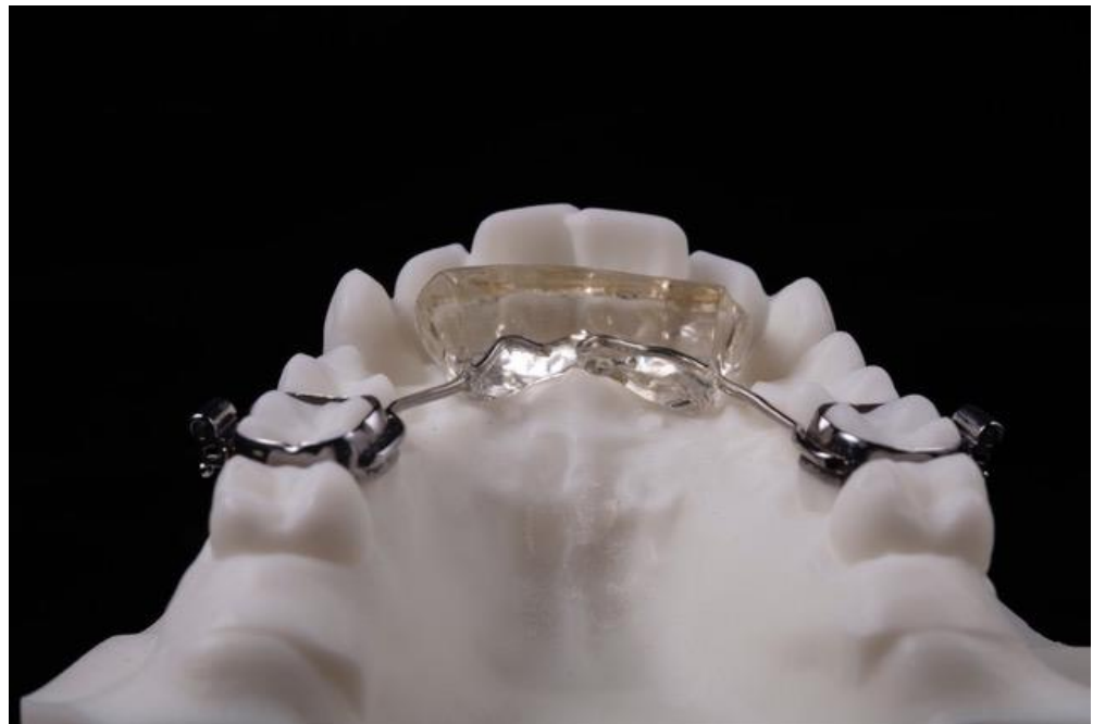
Figure 2. Acrylic resin wedge in the lower incisors.