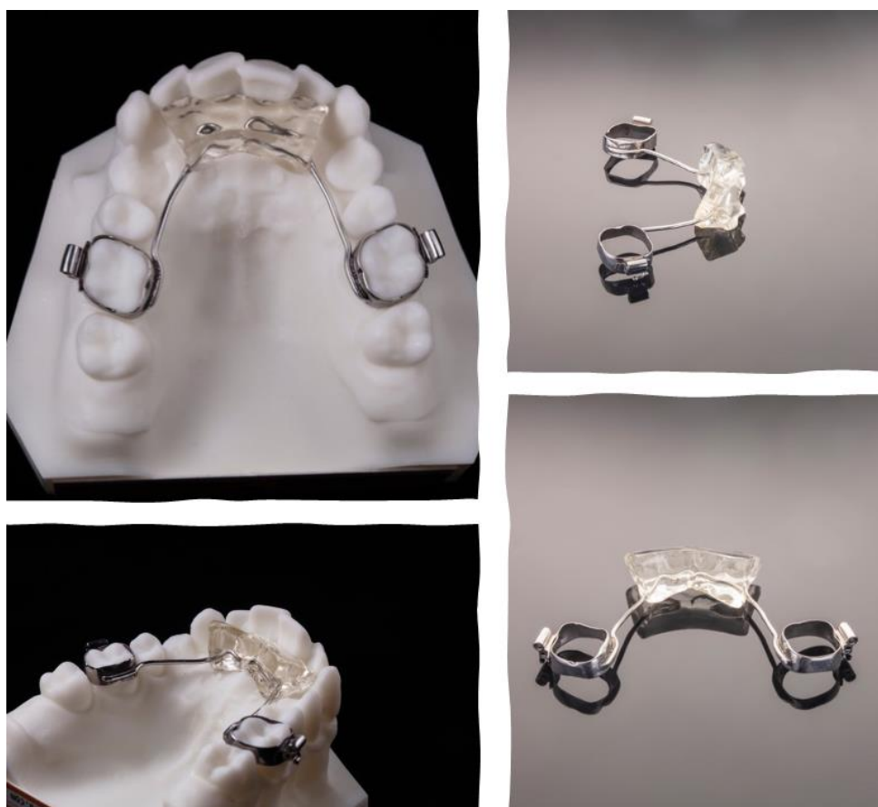
Figure 1. Austro Repositioner appliance design.

Subjects were treated in two phases. The first phase comprised the Austro Repositioner appliance, according to a previously described protocol [10] (Figure 1), specially designed by brachyfacial patients; in brief, the acrylic resin wedge was extended to the upper incisors, and in this anterior segment, the wedge was 1.0–1.5 mm thicker.