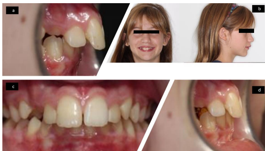
Figure 4. Photographs at T1: lateral intraoral without Austro Repositioner appliance (a), frontal and lateral facial (b), frontal intraoral (c), lateral intraoral with Austro Repositioner appliance (d).