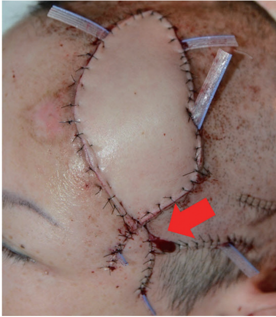
Fig. 3. Immediately after the reconstruction. The open end of the vein was monitored every 2 hours for continued blood drainage (red arrow).

Venous congestion is more common than arterial insufficiency after free flap transfer. Improperly managed venous congestion may result in flap necrosis. In order to prevent flap necrosis due to congestion, the flap should be allowed to drain the venous blood