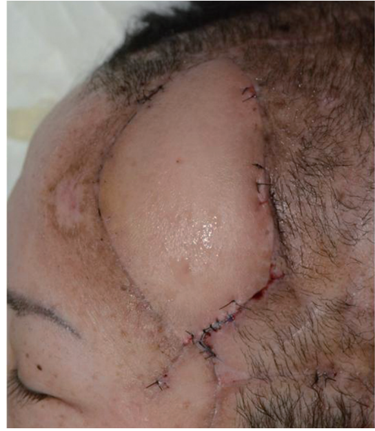
Fig. 4. Two weeks after the surgery. The flap survived without any signs of congestion.