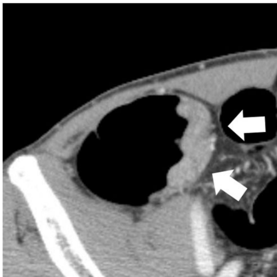
Fig. 2. CT image of a 54-year-old man with ascending colon cancer whose longitudinal length was 23 mm. The margin of the lesion was smooth (arrow), and pericolic fat stranding was not observed around the lesion. The circumferential proportion of the tumor was < 50\% , and pathological diagnosis of depth of invasion was T2.

We assessed the following factors: depth of invasion (T factor) and the presence of lymph node metastasis, lymphatic invasion, and venous invasion, in accordance with the Japanese Classification of Colorectal