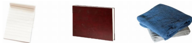
Figure 2 Examples of neutral pictures from food-pics: an image database for experimental research on eating and appetite.

Participants will be asked to watch the images and to rate their current emotion on scales of arousal, dominance and valence, for which the SAM will be used. 33 In addition, neutral objects will be displayed to provide control images (eg, towels and books; see figure 2 for examples of neutral images), which will be taken from an existing and validated database. 45 A break will be included halfway through the stimulus presentation to assess participants' emotional status and to prevent dissociations. 46 Image presentation and SAM rating screens will be pseudorandomised across all categories. Medical professionals will be monitoring the participants to prevent overtraining and to intervene if necessary. In total, 90 images will be shown (45 EPSI/45 neutral), each for 500 ms, followed by the SAM evaluation (see figure 3 for the study design). At the end of the experiment, participants