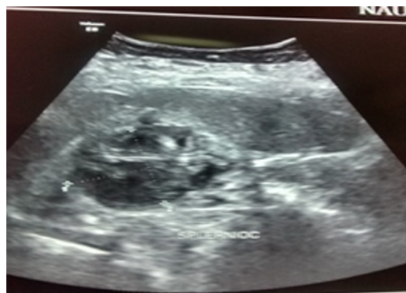
Fig. 1. Abdominal ultrasonography showed a well defined cystic lesion of about 46 ml volume is seen in the splenic parenchyma near the splenic hilum showing thick internal membranes and echoes.

A sixty one year old female patient presented with complaints of pain in the left hypochondrium with dyspepsia and heart burn for the past one year. Pain was dull aching and intermittent in nature, and increases after intake of meal. It resolved spontaneously after 1–2 h. There was no history of pet dogs or sheep at home. Abdominal examination showed no organomegaly. Laboratory blood tests were all within normal limits. X-ray chest and abdomen were unremarkable. Upper GI endoscopy was also normal (Figs. 1–4).