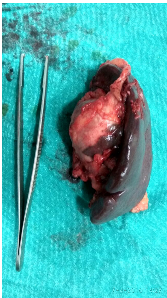
Fig. 3. Gross specimen of the spleen following its removal.

After Pneumococcal and H.influenza vaccination, laparoscopic splenectomy was performed. Four trocars were placed. First one (10 mm) was placed in the anterior axillary line below the left costal margin, second operating trocar (5 mm) at mid-axillary line below the left costal margin, third operating trocar (5 mm) at mid-clavicular line and fourth operating trocar (10 mm) was placed at 2–3 cm below the left costal margin.