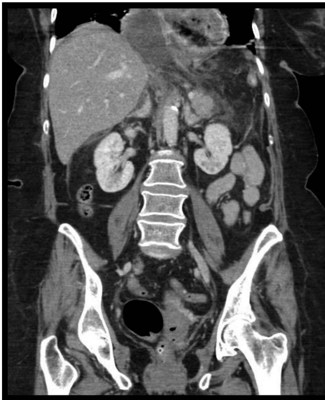
Figure 2. Coronal plane view of the large para-esophageal hernia.

reported a 2-week history of intermittent nausea and abdominal pain. She had multiple past medical comorbidities. On examination, the patient was tachycardic and hypoxic on room air, and there was tenderness in the epigastrium. On auscultation of the chest, there were reduced breath sounds on the right side. Investigations revealed a raised white blood cell count and C-reactive protein. An erect chest radiograph demonstrated a raised right hemidiaphragm as well as a large hiatus hernia. A CT demonstrated a large hiatus hernia with herniation of the