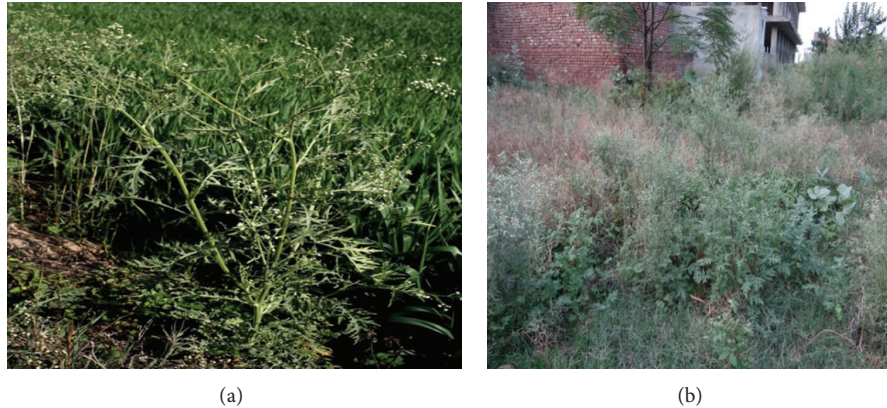
FIGURE 2: Area of infestation of parthenium; (a) crop field infestation; (b) residential plot infestation.

plus their ability to remain viable in the soil for many years pose one of the most complex problems for control [11]. Seeds do not have a dormancy period and are capable of germinating anytime when moisture is available. Seeds germinate within a week with the onset of monsoon and flowering starts after a month and continues up to another three months. In northwest India, parthenium germinates mainly in the months of February-March, attaining peak growth after rains in June-July and produces seeds in September-October. It normally completes its life cycle within 180–240 days. Its growth remains less and stunted from November to January due to severe cold [7, 12].