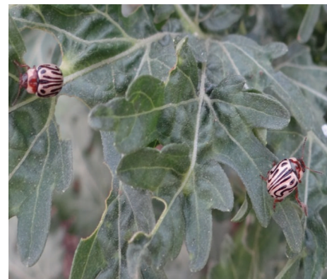
FIGURE 4: Zygogramma bicolorata feeding on parthenium weed.

(a) Insects as Classical Biocontrol Agents. Several insects have been tried to control parthenium weed in the different countries (Table 4). Of the various insects, the leaf-feeding beetle ( Zygogramma bicolorata ) (Figure 4) and the stem galling moth ( Epiblema strenuana ), both imported from Mexico, have shown good potential to control this weed. The beetle, Z. bicolorata , an effective leaf eater, was imported from Mexico for the management of parthenium in Australia in 1980, and in Indian Institute of Horticulture Research (IIHR) [45]. Both the adults and larvae of this insect feed on leaves.