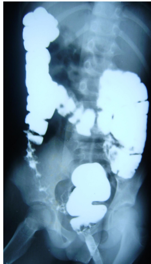
Figure 1 Barium enema showed dilatation of the sigmoid and descending colon, persistent narrowing of the rectum with effacement of the mucosal pattern that was replaced by thumb printing appearances.

Patient was commenced on sulfasalazine 50mg/kg/day in two divided doses and gradually increased to 60mg/