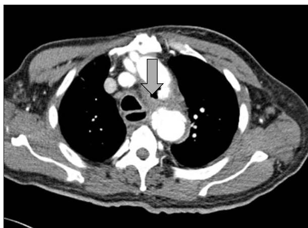
Fig. 1. Thoracoabdominal computed tomography revealed a perigraft abscess with an esophago-paraprostatic fistula (arrow).