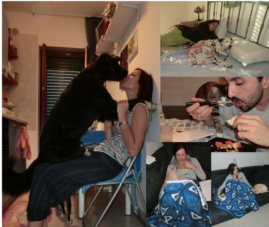
Figure 5 Close contact between privately owned pets and their owners. Although this behavior can be questionable, it cannot be considered at risk of infection with zoonotic nematodes for the owners.

that standard hygiene measures reduce at minimum the risk of acquiring zoonotic infections in this particular category [215,216].