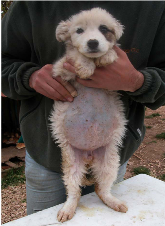
Figure 1 Pot belly in a roundworm-infected puppy.

dysbacteriosis and gas formation. In severe circumstances animals may suffer from thickened intestine, partial or total obstruction or occlusion, duodenum dilatation, peritonitis, bile and pancreatic ducts blockage, rupture of the intestine and worms at different stages expelled with the vomitus or the faeces (Figure 2); indeed, pups and kittens with heavy infections may expel a large mass of worms in vomitus [13,16,20,27], thus causing distress for the owner as the