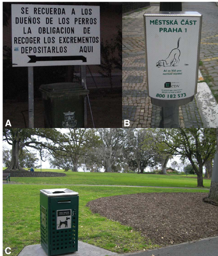
Figure 4 Dog-reserved areas and indications for pet owners in public areas in Valencia, Spain (A), Praha, Czech Republic (B) and Melbourne, Australia (C).

between the pet and the owner, even when some behaviour can be questionable (Figure 5). Actually, it is established that direct contact with infected pets presents no relevant risk in the transmission of intestinal nematodes and there is no association between pet ownership and infection occurrence [78,79]. Owners should have confidence that ownership of any companion animal is beneficial and safe as long as their pets are healthy [18]. Pet owners enjoy a plethora of advantages by living with dogs and/or cats. For instance, children, the elderly and disabled persons particularly benefit from their contact with a beloved pet. Companion animals represent a way of life for a lot of the people and this relationship provides socialization, mental health, and physical well-being: those who own a pet have been shown to display reduction in blood pressure and cholesterol levels, require less medical care, and it has also been reported that there is an improvement of life quality and quick recovery after heartbreaking events [209-213]. Therefore, owning companion animals is vital for the majority of families, especially when children and the elderly are