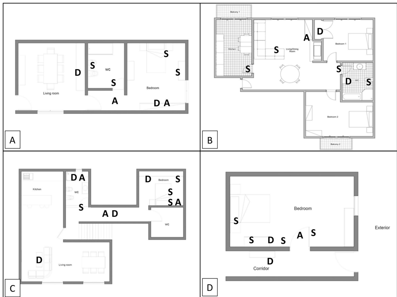
Figure 3. Schematic top view illustration of the representative house areas and sampling sites. The spaces where sampling occurred are designated accordingly (Houses A, B, C and D). A air samples, S surface samples, D deposition samples.

remote control, toilet flusher button, and bathroom door handle. Air and deposition samples were collected in the bedroom and in the living room, on top of the furniture, at a height above 1.6 m.