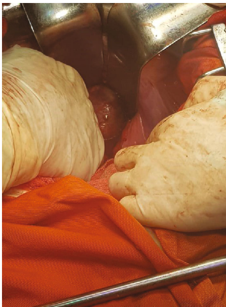
FIGURE 3: Preoperative aspect of the tumor.

the sacrum. The bladder, prostate, seminal vesicle, and recto-sigmoid colon were carefully dissected free, and we performed a monoblock resection of the tumor. The follow-up was simple and the patient was discharged 3 days later.