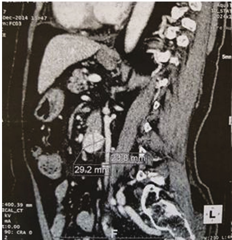
FIGURE 1: CT aspect of the tumor.