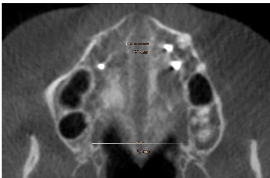
Fig. 3 Measurements on CBCT after maximum of non-surgical expansion at the anterior and posterior palate. The nasopalatine foramen (white bracket) and the greater palatine foramina on both sides (white line) were references for measurements

The statistical evaluations were carried out with the statistical program R (Version 3.1, R Foundation for Statistical Computing, Vienna, Austria). Normal distribution was tested with Shapiro-Wilk test and graphic data output. Continuous measures were represented by the