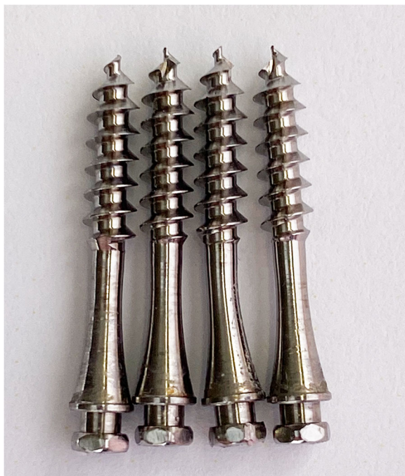
Fig. 4 Minor deformation of mini screw as seen in 4 patients in the present study

antero-posterior plane were also reported with SARPE protocols when using bone-borne devices [9, 31]. However, the pterygomaxillary junction seems to be the point with the highest resistance as studied in a finite element study by Holberg et al. [3] and might explain the expansion pattern of the non-surgical cohort in the present study.