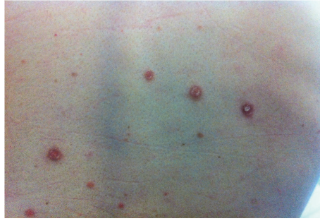
FIGURE 1: Generalized cutaneous erythematous maculae with distinct edges.