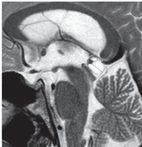
FIGURE 3: MRI of sella turcica at admission (August 2014): heterogeneous enlargement with peripheral contrast enhancement.