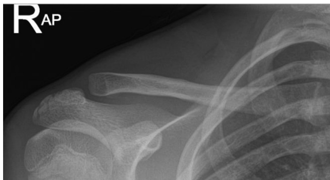
Fig. 1 – AP view.