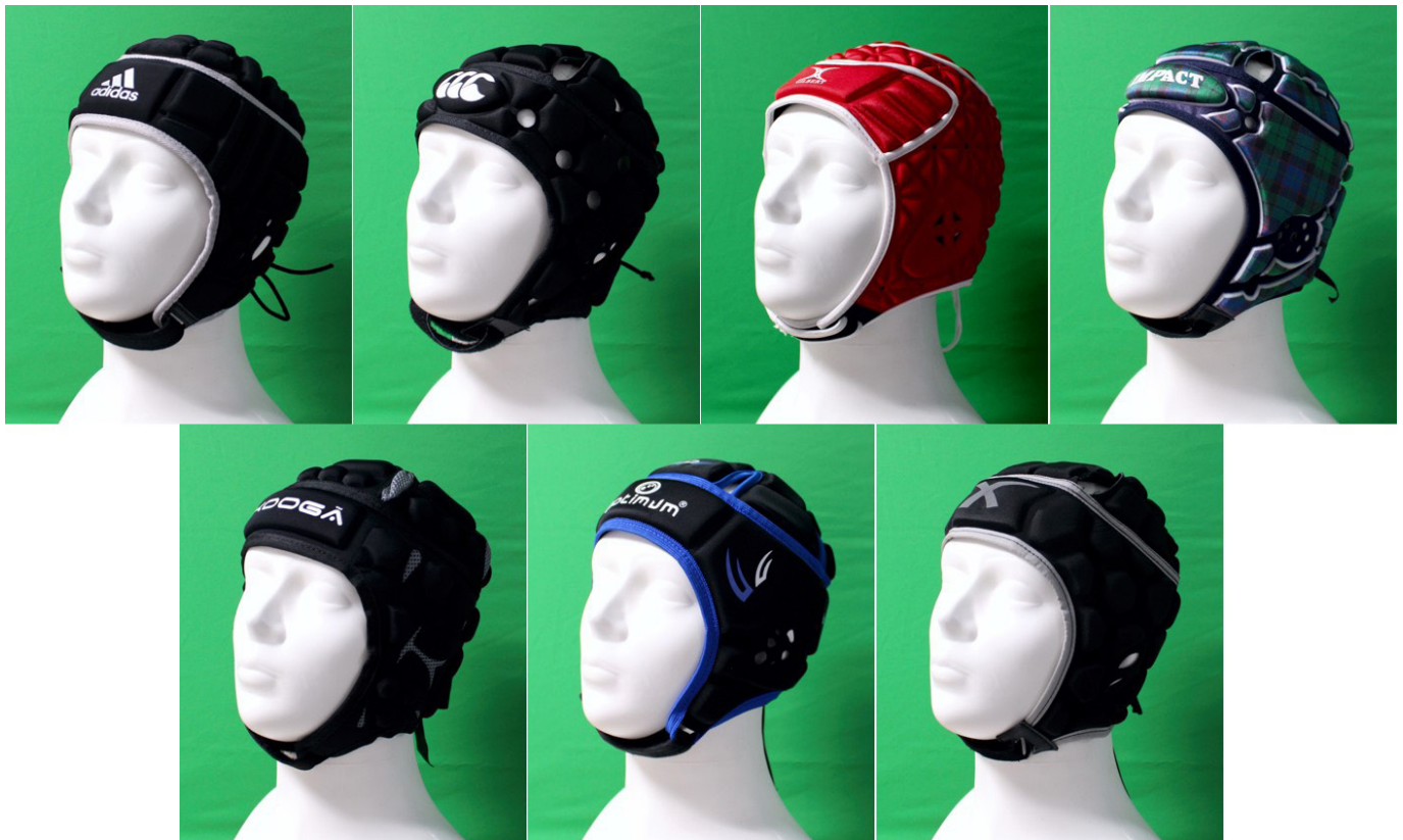
Figure 1 Headguards selected for testing (left to right): Adidas Rugby headguard (£34.95), Canterbury Ventilator headguard (£42.00), Gilbert Evolution headguard (£34.99), Impact RWC Tartan headguard (£39.99), Kooga Combat headguard (£28.99), Optimum Hedweb Classic headguard (£24.99) and XBlades Elite headguard (£34.99).