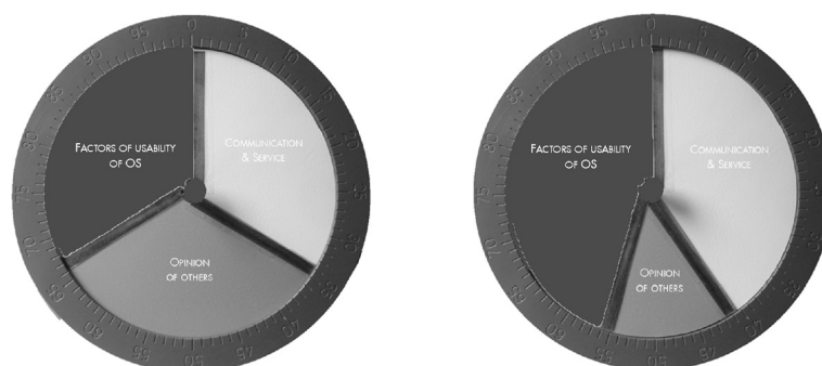
Figure 1 Disc used to measure the relative importance of the three domains of the interview [18]. Note: Two examples are shown. Left: this patient gave all three domains equal relative importance. Right: this patient gave the domains 'factors of usability of OS' and 'communication and service' almost equal relative importance, whereas the domain 'opinion of others' was considered to be less important. The score was measured from the second disc with the 100-point scale, which was placed around the circumference after the patient indicated to be satisfied with the result.