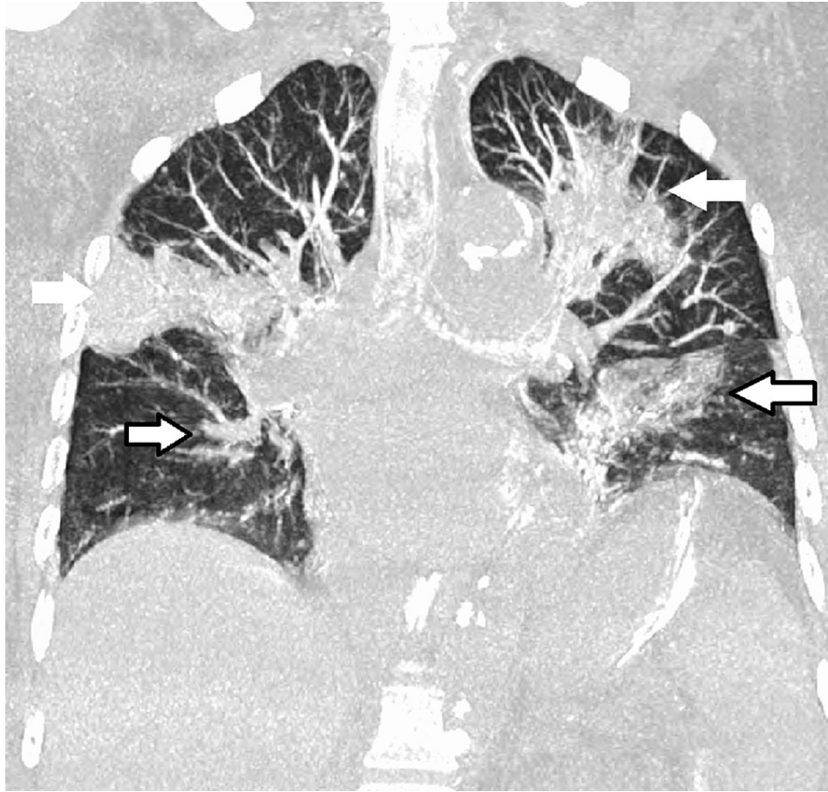
FIGURE 2: Coronal CT chest showing worsening bilateral infiltrates (white arrows) and new bilateral infiltrates (white arrows with black outline)

The patient's respiratory status progressively declined over her hospital course. Patient and family elected for do not resuscitate/do not intubate (DNR/DNI) and comfort-focused measures only. After five days of hospital stay, the patient passed away.