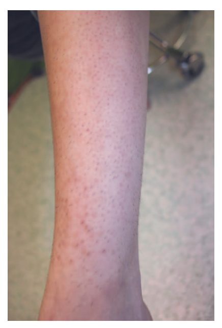
Fig. 3. Patient 1, donor leg 1 year after hair follicle extraction.

natural curvature of the follicle, giving an appearance of full and naturally curved eyelashes (Fig. 4). In patient 2, the nape hair eyelashes were rather straight and unruly without perming (Fig. 5) and slightly more unnatural looking. To sustain an orderly, naturally curled eyelash, the patient felt that regular perming by a professional at monthly intervals was necessary.