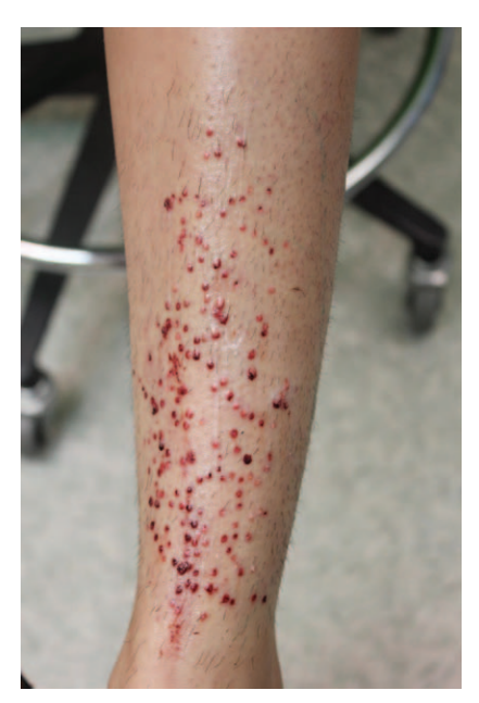
Fig. 2. Patient 1, donor leg after hair follicle extraction.

proximately 2-4mL each eyelid) consisting of a 1:5 bupivacaine and lidocaine 1:100,000 mix was injected into the subcutaneous layer of the lower two thirds of the upper eyelids. A rotary tool (UGraft prototype apparatus; Keck-Craig, Inc., Pasadena, Calif.) was used to mount a cutting punch device (UPunch Rotary; Dr. U Devices Inc., Redondo Beach, Calif.) that was fabricated at the author's office. The customized punch tip has a cutting axis that points away from the follicles, thus minimizing trauma to the graft during extraction. Texturing at the punch tip pulls the graft up as it cuts around the follicle, thus minimizing the exactness with which the operator must trace the angles of the follicles below the skin surface. Patient 1 required 20-gauge punches due to the small caliber of leg hair, whereas patient 2 required use of 19-gauge punches due to thicker caliber nape grafts. Only single hair follicles were selected for grafting in both patients, and almost all surrounding skin was removed from the extracted grafts.