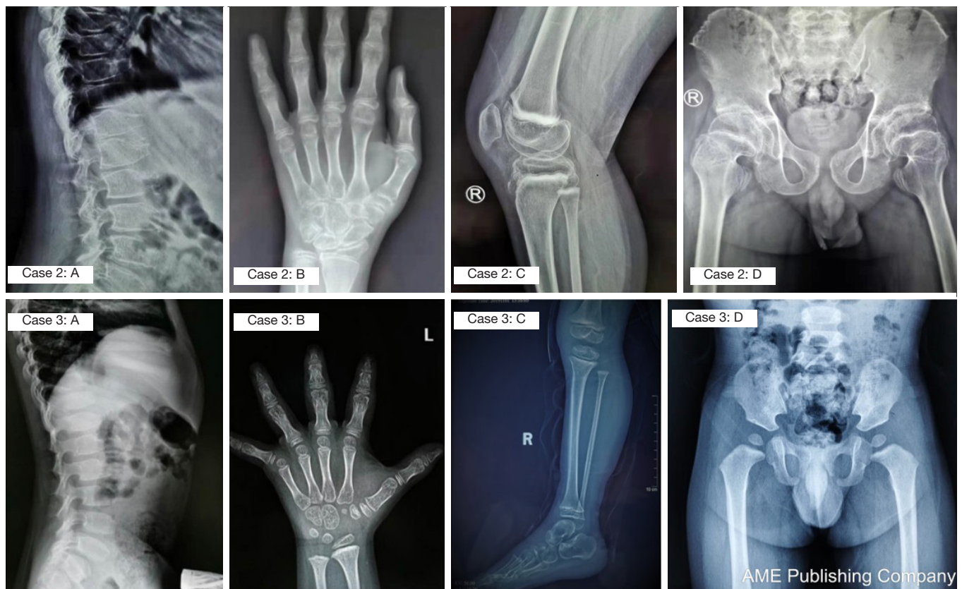
Figure 2 Radiographic findings in Case 2 and Case 3. Case 2A and Case 3A: flattened vertebrae or beaklike changes in the thoracic and lumbar spine. Case 2B and Case 3B: the metaphyses of the fingers on both palms are widened. Case 2C and Case 3C: the metaphysis of the knee is enlarged. Case 2D and Case 3D: A pelvic radiograph showing significant widening of the pubic symphysis space and hypoplasia of epiphysis.

(WES). DNA was isolated from peripheral blood using a DNA Isolation Kit (Biotek Corporation, AU1802, Wuxi, China). Genomic DNA samples (1 µg) were fragmented into 200–300 bp portions using a Covaris Acoustic System (Covaris, Woburn, MA, USA). The DNA fragments were then processed by end repair, A-tailing, adaptor ligation and four-cycle precapture polymerase chain reaction amplification, after which all exons and the 50 bp bases in their adjacent introns were captured with a SeqCap EZ Med Exome Enrichment Kit (Roche, Madison, WI, USA). The DNA library was subjected to postcapture amplification and purification, and then sequencing was performed on an Illumina HiSeq X Ten platform (Illumina, San Diego, CA, USA). The raw data were then filtered and aligned to the human genome reference (hg19) using the BWA Aligner ( http://bio-bwa.sourceforge.net/ ), and variants were identified using NextGene V2.3.4 software (Soft Genetics, LLC, State College PA, USA). The data