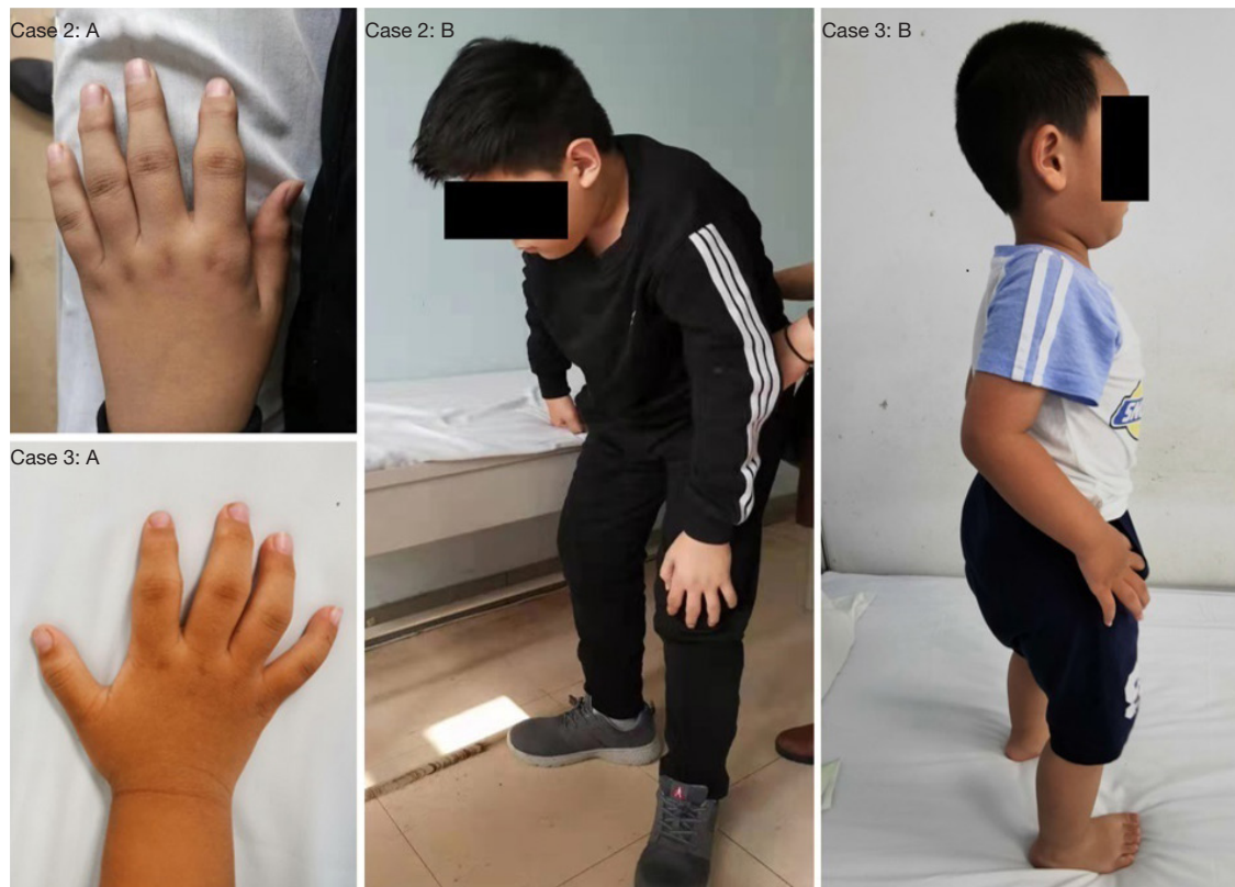
Figure 1 Clinical findings in Case 2 and Case 3. Case 2A and Case 3A: enlargement of the interphalangeal joints, with no swelling; Case 2B and Case 3B: passive posture, stiffness of the spine.

local hospital for the first time 2 years earlier. His alanine aminotransferase (ALT) level was 27 IU/L, his aspartate aminotransferase (AST) level was 58 U/L, his creatine kinase (CK) level was 302 IU/L, and his CK-MB level was 32 U/L, and he was observed without treatment. Two years earlier, he went to a local doctor because of short stature. A pituitary MRI suggested hypophysis dysplasia, which was diagnosed as a partial growth hormone deficiency. He was administered growth hormone treatment for 14 months, and his height increased by 7 cm but his faltering gait became more serious. One year earlier, the posterior tilt of his buttocks was more pronounced, and his height increased 4 cm with growth hormone treatment. He did not like walking, preferring to play in bed. His grandmother was 140 cm tall and had experienced difficulty squatting and getting up since the age of 40. His developmental milestones were all normal. His height was 99 cm (<3 rd percentile, -3.3 SD), and his weight was 19.8 kg (50 th percentile). He presented a forced posture and was unable to stand upright ( Figure 1 ). He also exhibited a short neck, enlargement of phalangeal